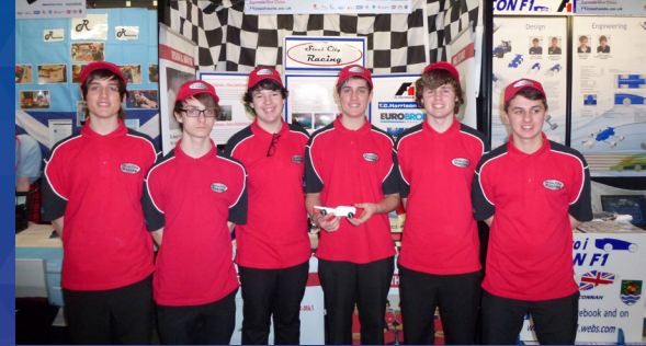
F1 in Schools UK National Finals 2013