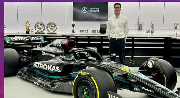
George at work at Mercedes-AMG PETRONAS F1 Team

“ The competition is a unique platform for developing young people.